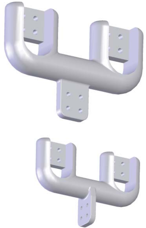
"Use prefix BATV"