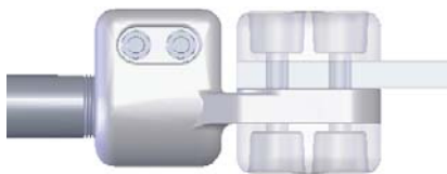
Shown here with available bolt shields.

Manufactured of a lightweight aluminum alloy, the Type EHV ASTB, which connects a threaded stud to a flat bar bus, features clamping hardware of high tensile aluminum for resistance to corrosion. Corona free performance is achievable up to 345KV with the use of available bolt shields. Contact sealant is recommended.